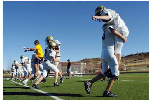
Above: Demonstrating rolling the hips and grabbing cloth