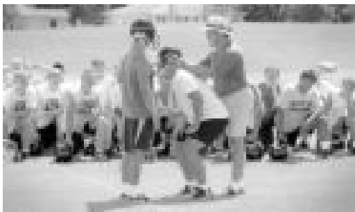
Above: Demonstrating proper eye level

Hip Roll- As you are exploding into the ball carrier, act like you have a quarter in your cheeks and you don't want it to fall out meaning, thrusting the pelvic region into the ball carrier as you are grabbing cloth which will force him off balance and to the ground.